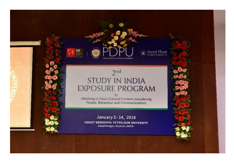
A glimpse from the valedictory session preparations