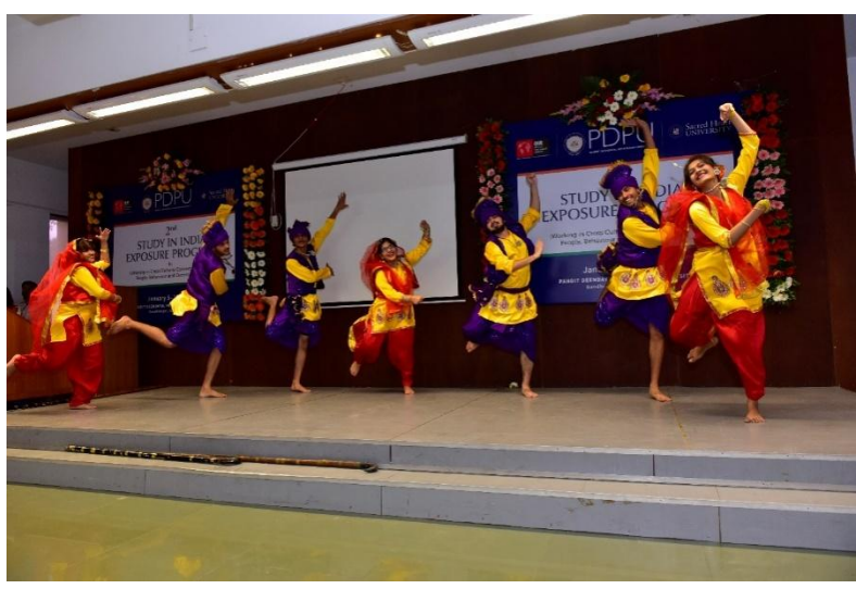
Cultural Dance Performances by PDPU Students