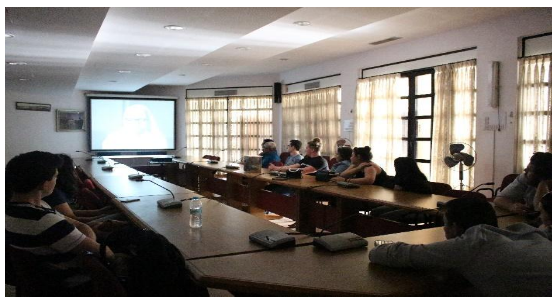
Distinguished Guest Talk on Indian Business structure and corporate culture of cooperatives; and a visit to AMUL Dairy and museum