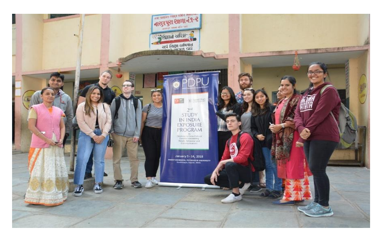
Student Delegation from SHU and the student volunteers from PDPU at Akshaya Part Foundation & visit to local Schools

The delegates also visited the printing office of Times of India in order to understand the process of newspaper printing and circulation. This informative exposure to the printing press was much appreciated by the delegates before leaving for dinner at Rajwadu.